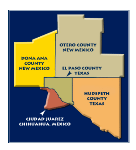
Figure 3 Paso Del Norte Region (<a href="http://www.pdnhf.org/who_we_serve.asp">http://www.pdnhf.org/who_we_serve.asp</a>)

The U.S.-Mexico border covers an area of 2,000 miles, spanning four U.S. and six Mexican states, 48 U.S. and 80 Mexican "municipios," or counties, and extends 100 kilometers (62 miles) from the international boundary, both north into the United States and south into Mexico (Bureau of Primary Health Care, n.d.). Up from six million in 1970, the US-Mexico border area currently has a combined population of approximately 13 million (U.S.-Mexico Border Health Commission, 2003), and is projected to double by the year 2020 (Homedes & Ugalde, 2003). Figure 3 illustrates the Paso del Norte border region.