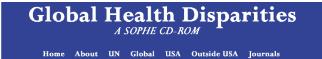
Figure 1 Temporary Global Health Disparities CD-ROM Header

A page header design for all of the web pages on the CD-ROM was created toward the end of the process. A simple, temporary header was used to visualize how the final product would look (Figure 1). Of course, for the final CD-ROM, the graphic images used in the header would need to communicate a global theme. A three-dimensional globe overlaid a two-dimensional map of the earth (Figure 2).