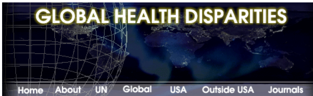
Figure 2 Final Global Health Disparities CD-ROM Header