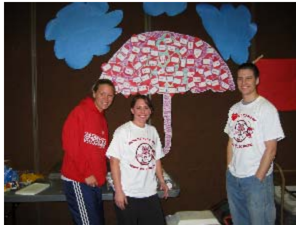
Figure 13 April Showers donor recognition display

Each semester we create a different t-shirt design and give our donors a free shirt. Fund-raising is required for us to do this, which provides another component to the service project. At times, our local blood bank provides recognition items such as pints of ice cream, personal pizzas, and t-shirts for every donor. These types of items are not always available so we make sure to create our own recognition package.