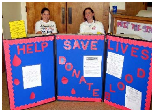
Figure 2 Blood Drive Check-In Table