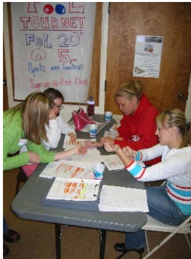
Figure 14 Students analyzing donor evaluation forms