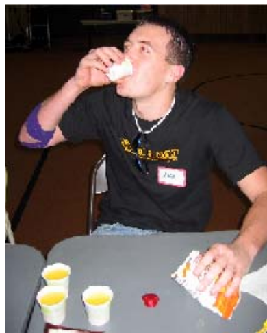
Figure 5 Students enjoying the refreshment table with orange juice shots

donation process should not cause illness or weakness, or affect the rest of the day. Students working the refreshment area should be trained to handle a donor who feels faint or nauseous. While the donors wait their 10 minutes, they can be asked to give feedback about their experience through an oral interview or a written survey. This information can be valuable when the class is evaluating the blood drive.