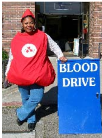
Figure 7 Student dressed as a giant blood drop as a gorilla technique