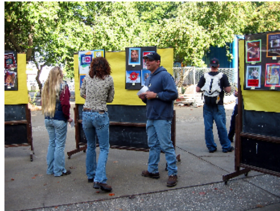
Figure 9 Students rating the blood drive posters

discussing the posters with friends. Unlike posters created by blood centers to appeal to the general population, our posters were designed by college students for college students. All of the posters can be viewed on our website (HCSV, 2005). The recruiting we did during the poster art show was more lucrative than all of the traditional methods put together.