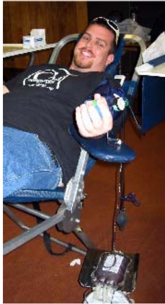
Figure 4 Male student giving blood

The refreshment table is the place to replenish fluids and sugar and thank the donors for their contribution. Donors are required to stay at least 10 minutes. There should be a variety of foods available and student workers available to serve the donors. Recognition items can be given at this time. Some donors have a reaction after giving blood and the refreshment area is an opportunity to make sure every donor is feeling well enough to leave. For the healthy donor, the