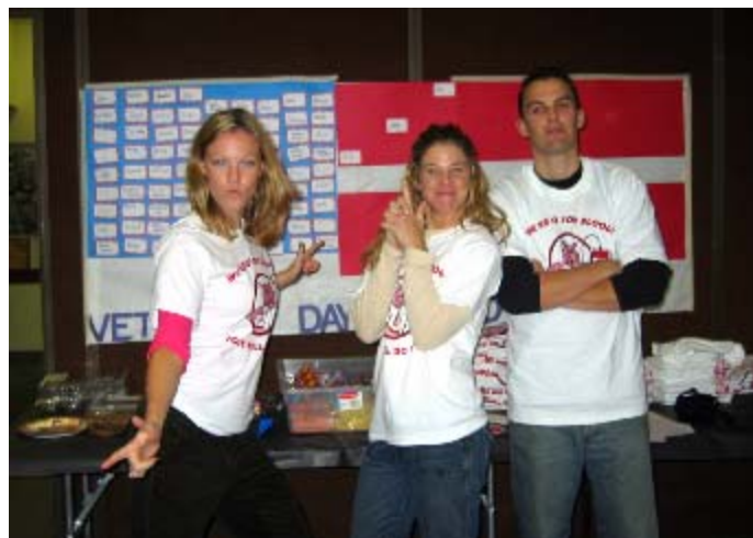
Figure 12 Veteran's Day donor recognition display