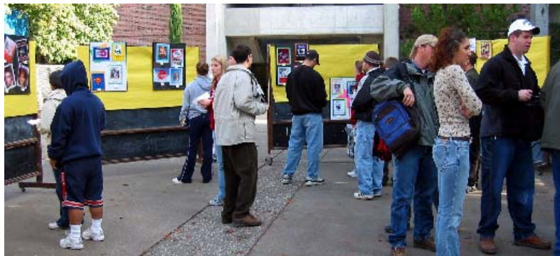
Figure 10 Students rating the blood drive posters