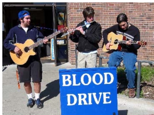
Figure 8 Student band performing to draw a crowd