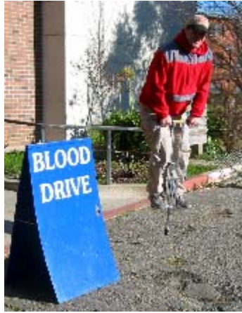
Figure 6 Pogo stick competition as a gorilla technique