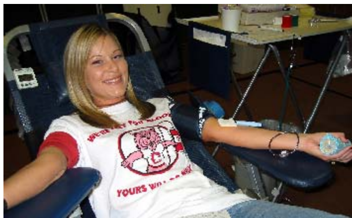
Figure 3 Female student giving blood

The actual blood donation is usually the quickest part of the whole process. The steps so far can take 30 minutes or more, while the donation process usually takes about five to seven minutes. The donor's arm is cleaned, their blood pressure and pulse is monitored, and the needle is inserted. Most donors, even the veterans, look away while the needle is inserted. If the donor doesn't want to see any of the process, a towel can be spread over the site. After the pint has been filled, the donor gets a bandage and heads to the refreshment table.