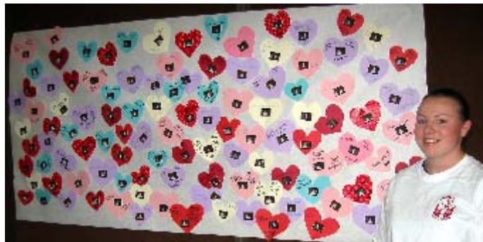
Figure 11 Valentine's Day donor recognition display

be said through a display that communicates appreciation and includes the donor's name. Students can create a display that reflects the theme of the drive. Examples from our drives include: 1) a large blood bag with each donor's name tag added at the refreshment table; 2) paper hearts that the donors write statements on for a Valentine's Day drive; 3) a flag with the name tags as stars for a Veteran's Day drive; and 4) an umbrella with blood drop rain for an April showers spring theme. Donors can see how many pints have been given at that point in the drive, and the display can be posted after the drive to educate others about blood donation.