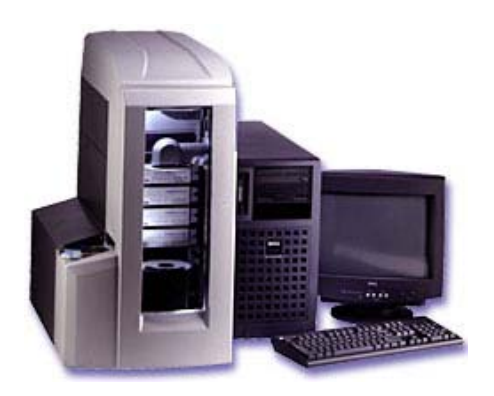
Figure 2 Autostar II Autoduplicators from Rimage (Rimage, 2002)

There are several options to label the CD-ROM. Paper labels may be printed and "stomped" on each CD-ROM, labels may be printed directly to the surface of the CD-ROM using inkjet or thermal CD-ROM label printers, or labels may be silk-screened by a professional printer.