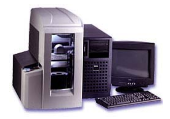
Figure 1 Protégé II. Autoduplicators from Rimage (Rimage, 2002).

molds are made from the master CD-ROM and plastic is injected into the mold, similar to the process of how music records were made. Usually when CD-ROMs are mass produced by CD-ROM printers, the CD-ROMs are molded rather than "burned."