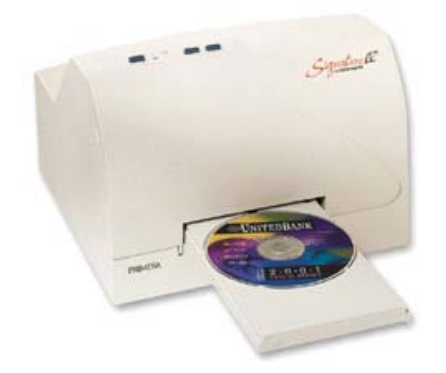
Figure 3 Primera Signature IV CD-ROM Color Printer.

Figure 5 is the Primera Bravo, an autoduplicator with inkjet CD-ROM printer. Although Primera and Rimage products tend to be higher priced than printers you may be able to obtain, the quality of printing and reputation of these products in the industry are unsurpassed.