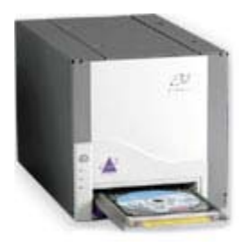
Figure 4 Rimage Everest Printer Standalone Thermal Printers from Rimage.