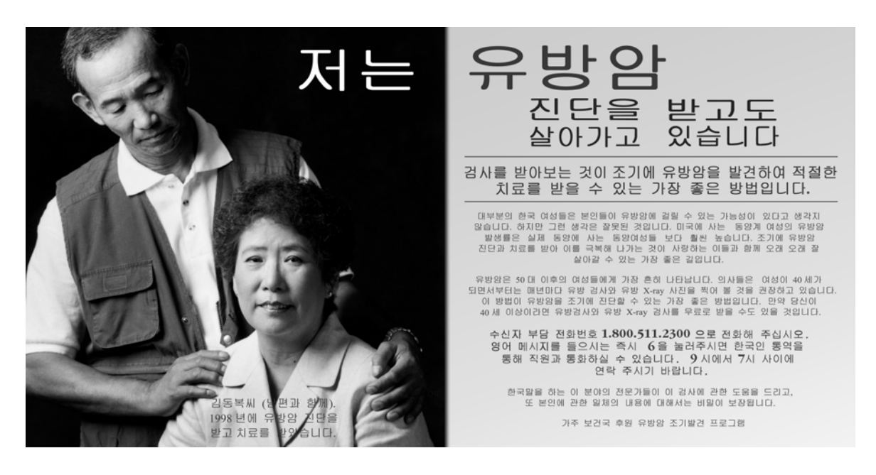
Figure 2 Breast Cancer Early Detection Program (BCEDP) Poster in Korean