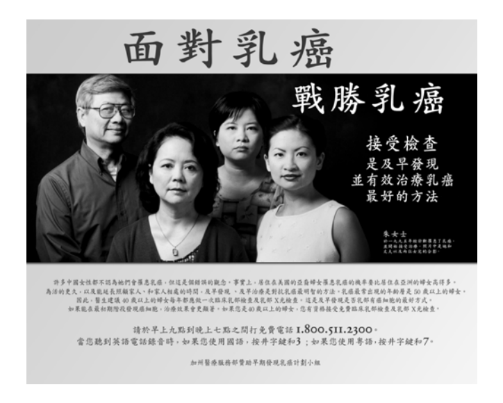
Figure 1 Breast Cancer Early Detection Program (BCEDP) Poster in Chinese